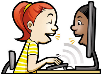
A Parent's Guide to Social Media