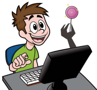
A Parent's Guide to Online Grooming